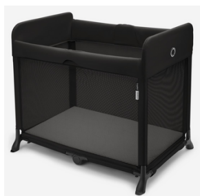
Bugaboo Stardust travel cot

Designed with the brand's signature craftsmanship and elegance, the Bugaboo Stardust umbrella bed offers an all-in-one solution for your baby to sleep or play in complete serenity, at home or on the move. With its revolutionary folding system, integrated mattress and lightweight, functional design, this bed simplifies life for parents while ensuring optimum comfort for toddlers. It's the essential accessory for simple moments of relaxation, wherever you are.