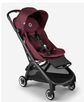
Bugaboo Butterfly pushchair

The Bugaboo Giraffe high chair is a concentrate of intelligent design and ergonomics, designed to accompany children from birth and throughout their growth. True to the spirit of the Bugaboo brand, the Giraffe stands out for its versatility, durability and elegant style, which blends in perfectly with any interior. This high chair is ideal for families with young children, as it can be used for both playtime and mealtimes.