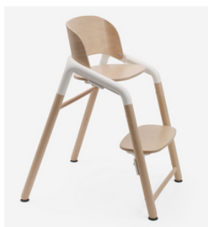
Bugaboo Giraffe high chair

Designed with the brand's signature craftsmanship and elegance, the Bugaboo Stardust umbrella bed offers an all-in-one solution for your baby to sleep or play in complete serenity, at home or on the move. With its revolutionary folding system, integrated mattress and lightweight, functional design, this bed simplifies life for parents while ensuring optimum comfort for toddlers. It's the essential accessory for simple moments of relaxation, wherever you are.